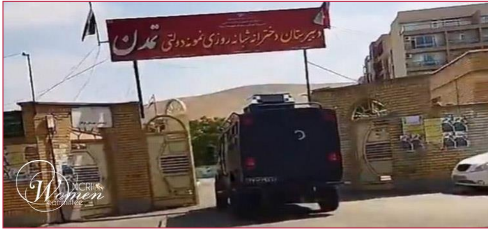
Armored vehicle entering Tamaddon High School in Bukan, Iranian Kurdistan