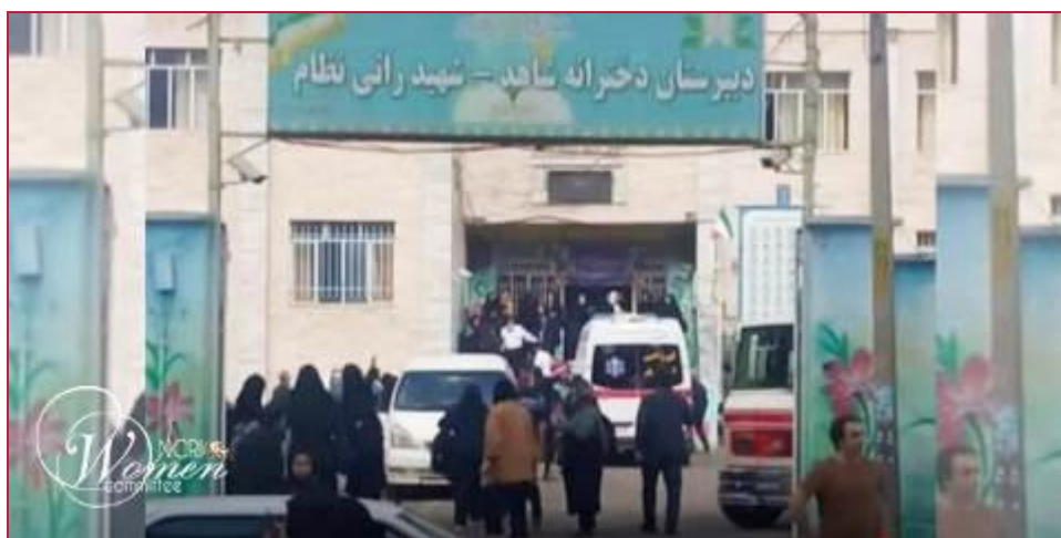
Shahed High School in Ardabil, students, parents, and the ambulance carrying the injured