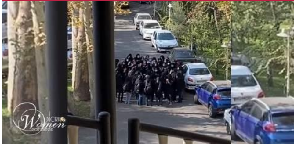
Students of Allameh University in Tehran gather and chant anti-regime slogans

On October 24, students of Khajeh Nasir University in Tehran strongly opposed the presence of the Raisi government spokesman on their campus to hold a theatrical dialogue. Khajeh Nasir students vowed to overthrow Khamenei this year and chanted, “Murderer, get lost!” and “We don’t want a corrupt system, nor a murderer as a guest!” among dozens of other anti-regime slogans. Khajeh Nasir students thus forced the government spokesman to leave the university.